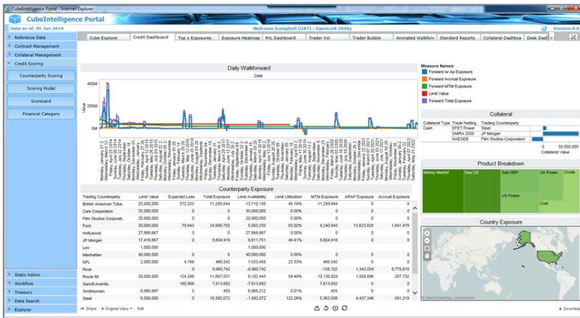
Figure 1: A Typical Dashboard