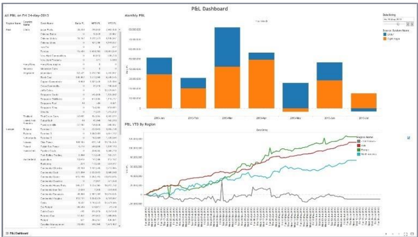
Figure 1: Graphing Portfolio Performance from the Position Cube